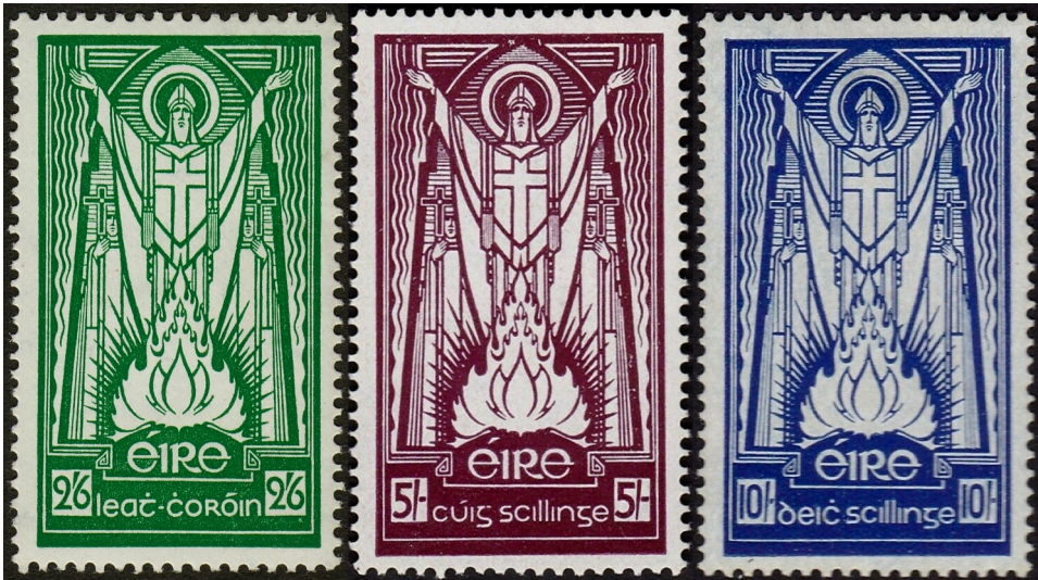
Set of stamps brought out in 1937 in honor of St. Patrick.